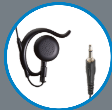
EAR HANGER EARPIECE FOR RSM