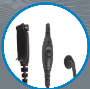
ONE-WIRE EARBUD WITH IN-LINE PTT

* A variety of other accessory options, including single and 6-way chargers, are also available