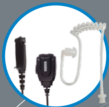
TWO-WIRE ACOUSTIC TUBE EARPIECE WITH IN-LINE PTT