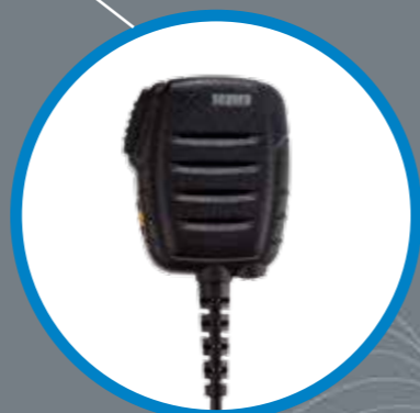
REMOTE SPEAKER MICROPHONE