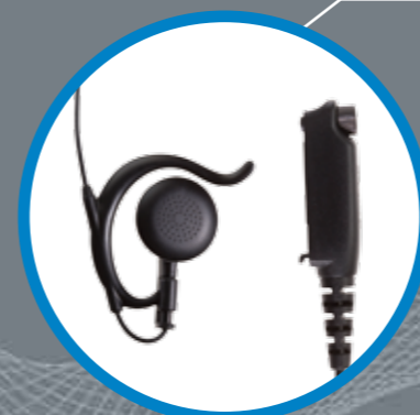
ONE-WIRE EAR HANGER